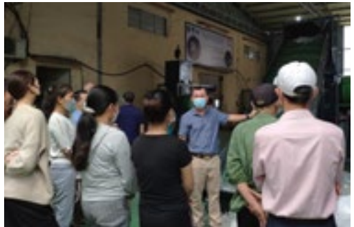
Training activities for local (plastic recycling) households in Minh Khai and Phan Boi craft villages

• To deploy monitoring and support households to troubleshoot (if necessary) during the 12 month guarantee period (by 07/2023).