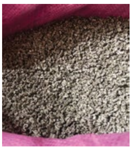
Plastic recycling activities in Tien Duoc commune, Soc Son district, Hanoi