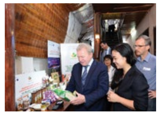
Product introduction of Eco-fair project