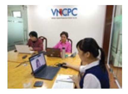
Online training session on "Preferential source of capital for sustainable production and loan application"