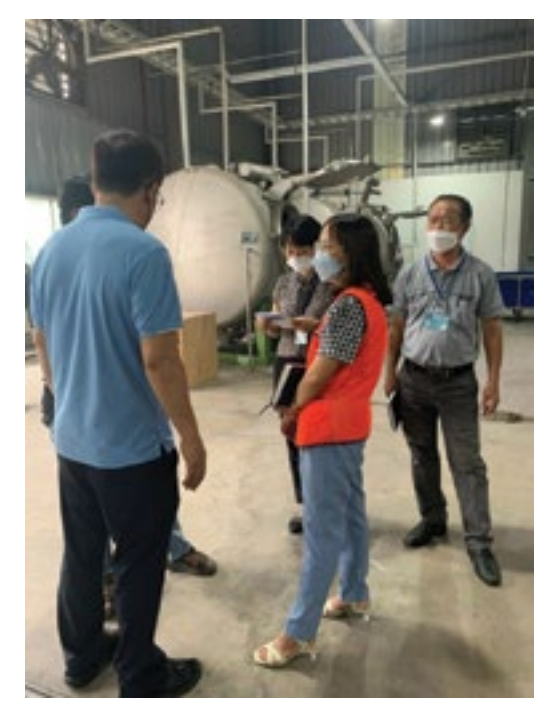
Workshops of tenant companies