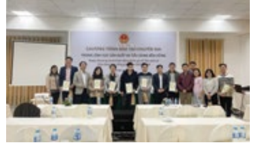
Participants received certificates after completing the course

• Organized 01 SCP training course for the fundamental and in-depth levels for experts. The course attracted 30 participants offline and 19 others online through the zoom platform.