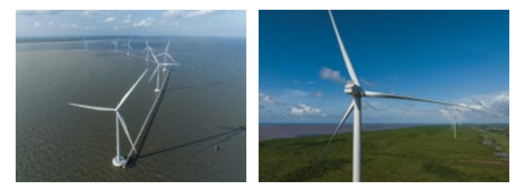
Soc Trang 7 and Lac Hoa Wind Power Plants

Implementing partners: Ginger-Burgeap, VNCPC, Espelia and Keran Asia Duration: 06/2021 - 05/2022 (extended until 12/2022) Sectors: industries, renewable energy Regions: Vietnam Contact: Nguyen Le Hang Email: hang.nl@vncpc.org Tel: (84-24) 3868 4849 - ext 14