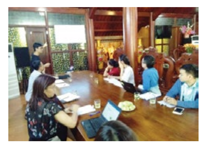
Work meeting with the factory technical team