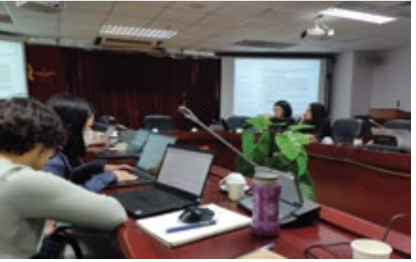
Working with the expert team on the development of the Guideline