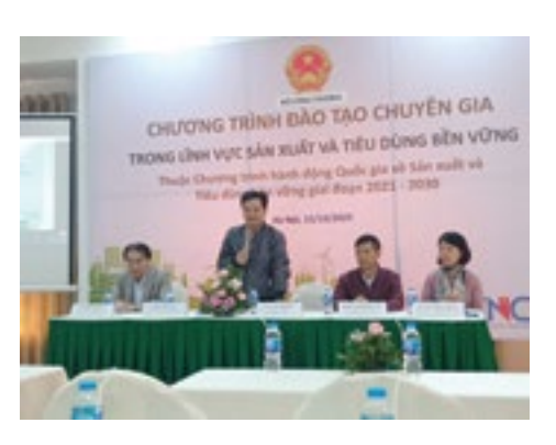
Representative of MOIT speaking at the opening of the training course

• Organized 01 SCP training course for the fundamental and in-depth levels for experts. The course attracted 30 participants offline and 19 others online through the zoom platform.