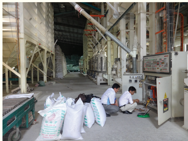
RECP solutions proposed by experts help enterprises to save significant energy and raw materials and minimize wastes

Other solutions, which require investment, such as replacing the existing motors by high-efficiency ones, tower drying system instead of bed drying one to improve the quality of rice grain, can bring forth higher efficiency and benefits in the long-run.