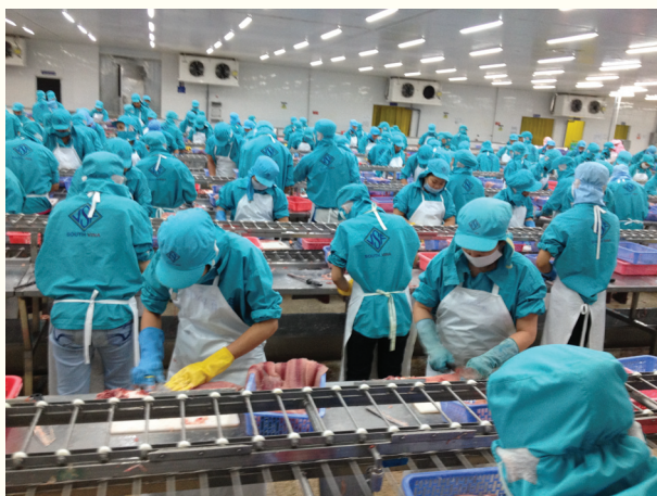
Co-creation activities bring forth new ideas for diversifying the product range and reducing wastes in pangasius processing

The project organized co-creation workshops with the participation of 2 European and 20 Vietnamese consumer groups. Results of these co-creation served as inputs for sustainable product innovation of enterprises and experts, which gave rise for 20 more sustainable products consisting of 10 newly-designed and 10 redesigned ones and transferred to 7 companies. More of the fish's parts are turned to value-added products. This contributes to broadened domestic market because of more diversified product range.