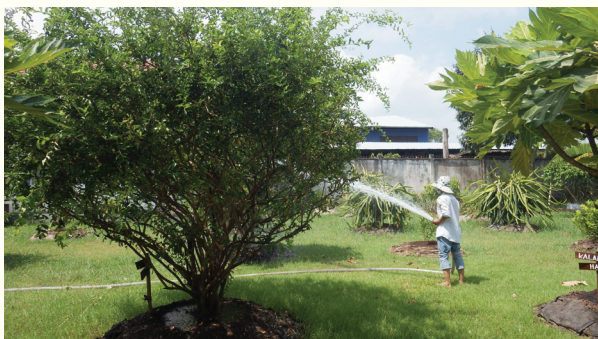
Watering the internal garden by treated wastewater

The RECP training and consultancy activities were implemented completely at 23 enterprises in August 2016. In 2017, two monitoring rounds of Batch 1 were fulfilled in order to update the RECP implementation results of participating companies.