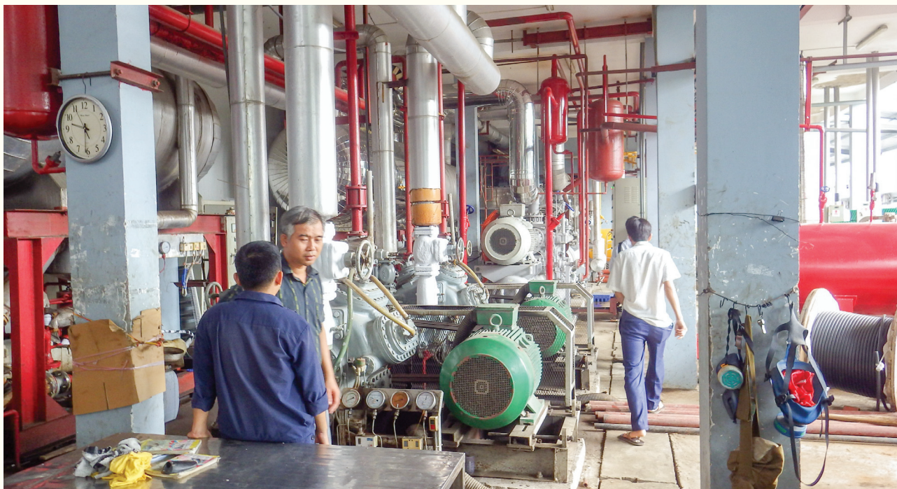
The project's purpose is to raise the awareness of trade union officers and workers on green growth

VNCPC experts provided training sessions on Green Growth in 2 trainings courses, which organized by FES. Green Growth team of Trade union at 15 enterprises, which are from various industrial sectors in Long An, Nam Dinh, Quang Nam, Hue, Binh Dinh, Tien Giang and Dong Thap provinces, cooperated and received direct consultancy from VNCPC experts in the period of June - October 2017 in order to develop their own Action plan for Green Growth.