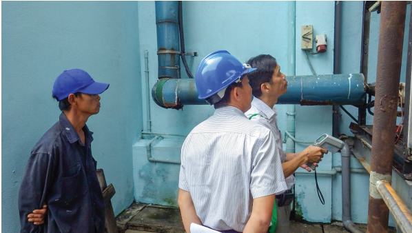
VNCPC expert conducts RECP assessment at the factory

The project provided RECP assessment and coaching for 72 pangasius processing factories in An Giang, Dong Thap, Vinh Long, Hau Giang, Tien Giang, Ben Tre and Can Tho, out of which 54 received in-depth RECP consultancy. Besides, 300 technical staff has been trained on RECP implementation methodology.