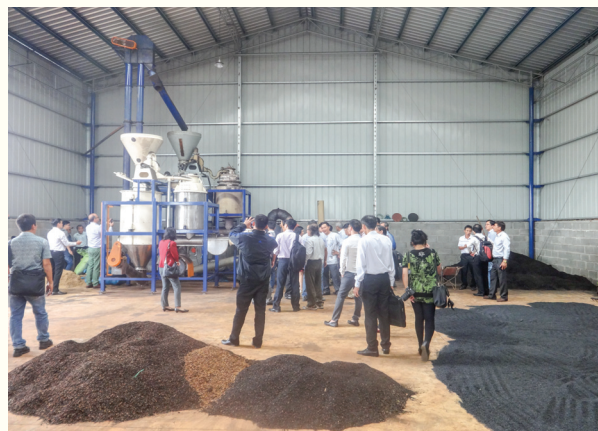
Participants visited the pyrolysis technology model in Dak Lak

However, with the pyrolysis technology successfully transferred from Switzerland and adapted by Viet Hien Mechanical Company to Vietnam's context, coffee growers can recover heat by a stable burning that well facilitates drying process, while use biochar - a by-product of pyrolysis process - as fertilizer for soil improvement at the same time.