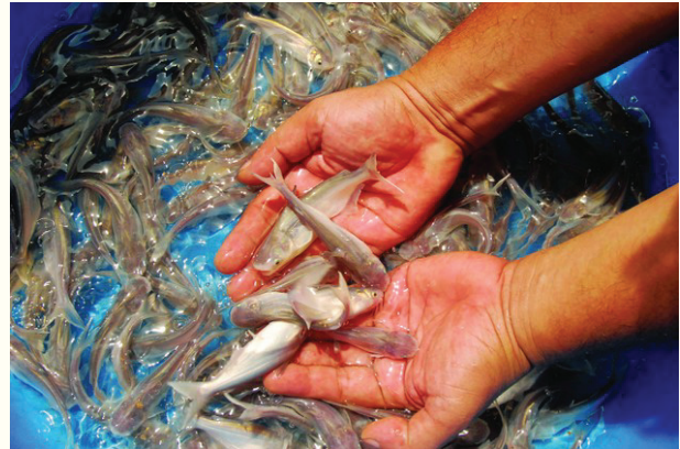
Advanced techniques have been applied in pangasius farming