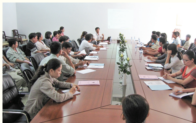
Technical training for technical staff of processing enterprises

17 half-day training sessions were provided to 903 participants and other 16 technical workshops were delivered to 800 participants. As the results of these, participating farmers have been equipped with updated knowledge, improvement solutions and the access to advanced hatchery techniques. Along with this, local fishery authorities were engaged through awareness raising and information update for better sector management.