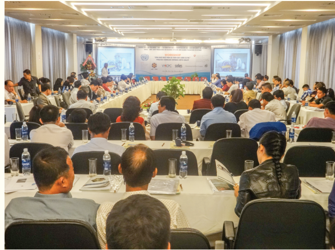
Workshop for coffee sector (Buon Ma Thuot, Dak Lak)

Workshop on "Towards a sustainable rice value chain in the Mekong Delta in Vietnam" (March 3 rd , 2017, Can Tho) was held with the attendance of more than 50 delegates from the related partners and milling plants in the Mekong Delta. This was a consultation workshop under the framework of the project "Industrial waste minimization for low carbon production". The workshop introduced the project's implementation results on technology intervention, low-carbon business models in rice sector and consulted with stakeholders for the completion of low-carbon solutions implementation and replication in the rice sector.