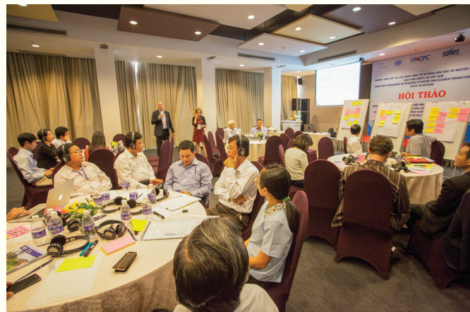
Consultation workshop for stakeholders and milling factories in the Mekong Delta (Can Tho)