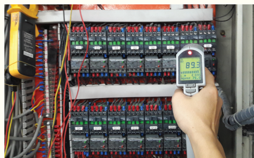
RECP implementation helps enterprises reduce input consumption significantly

During this period, there were 23 enterprises in two IZs (12 in Da Nang and 11 in Can Tho) completed a full RECP assessment cycle.