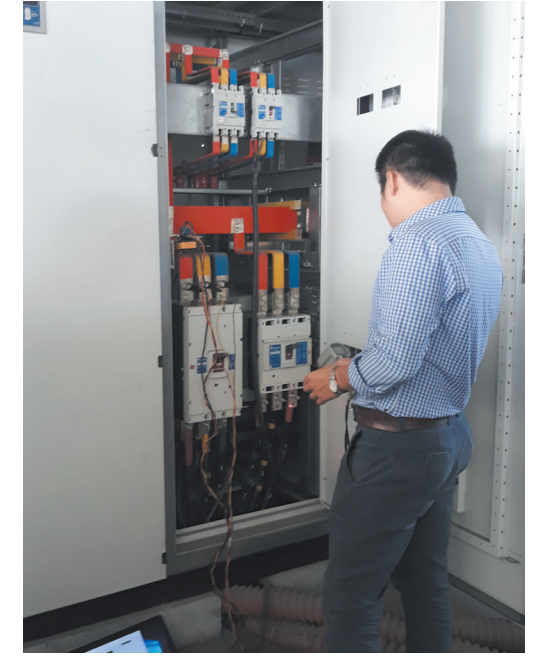
Electricity measurement at enterprises