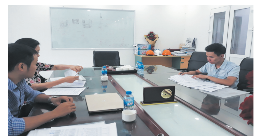
Working with technical staff at the company

Total savings are about 2.8 million Euro, with total investment of 2.0 million Euro.