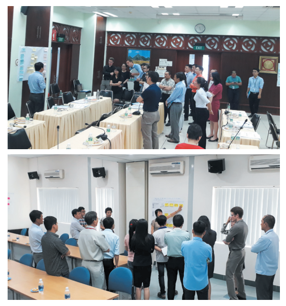
Discusion on EIP opportunities identification and business case