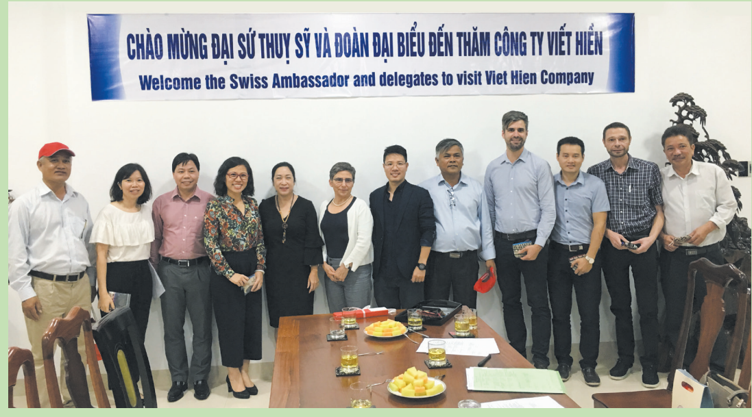
Representative of Viet Hien Mechanical Company introduced technology transfer results to the Swiss Ambassador