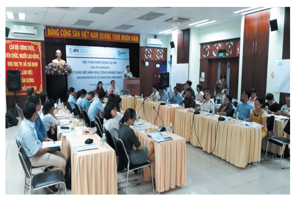
Kick-off workshop in Ho Chi Minh city