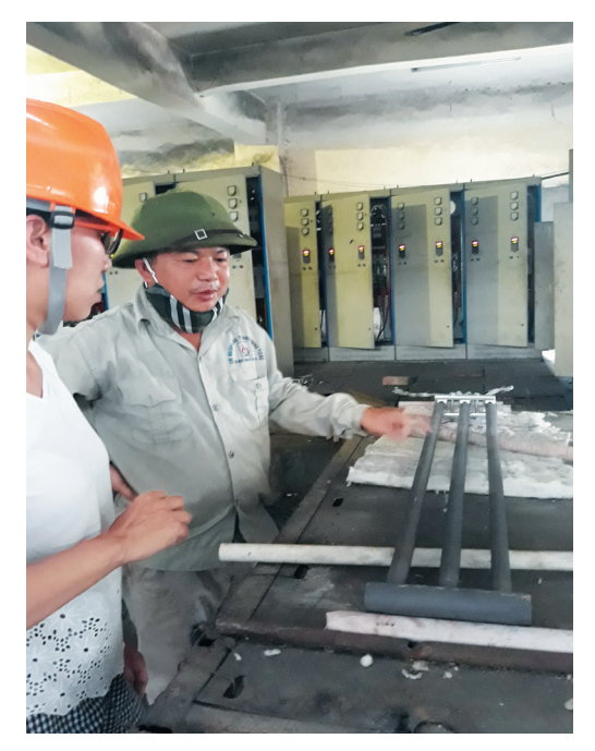
Conducting site assessment