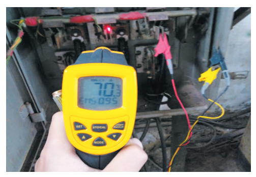
Bad contact at electric cabinet