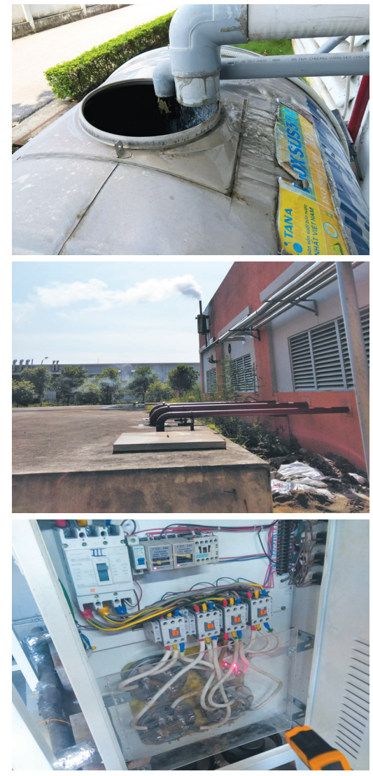
Electricity measurement, steam system assessment and water loss survey