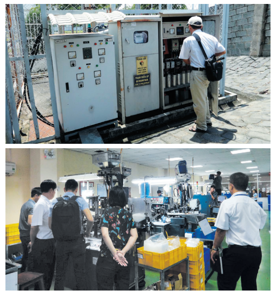
Site assessment on RECP and EIP