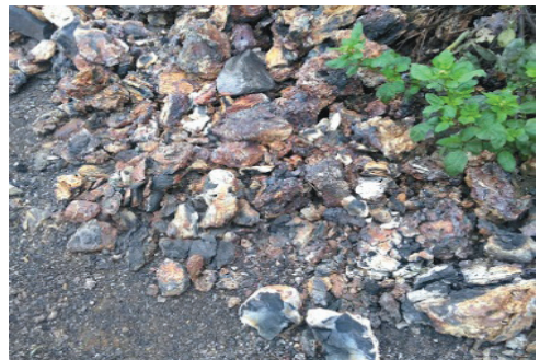
Coal does not combusted completely