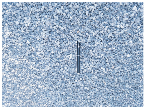
The materials of concrete brick production