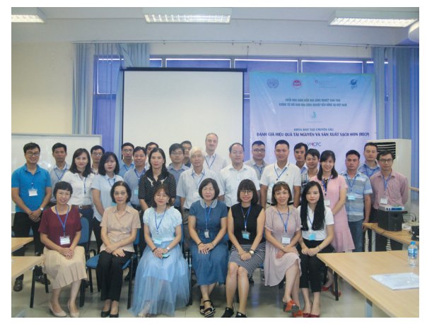
Participants of the training course in Hanoi, September 5 - 6, 2018

Two intensive RECP training courses were successfully organized in Hanoi and HCM city for 54 local experts. The participants mainly work for cleaner production or energy efficiency of in-charged departments of provinces and cities, lecturers of universities teaching on cleaner production, institutes and enterprises in Vietnam. During two-days training, participants were coached in-depth on RECP techniques, practical examples and assessment skills covering 5 thematic topics of energy, materials, water, effective chemical use and waste management. They will sever as resource experts for the local RECP implemention. The training course received great attention and appreciation from participants as well as the project management unit.