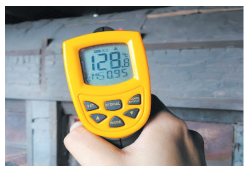
Insulation of Tea Withering machine does not function well.